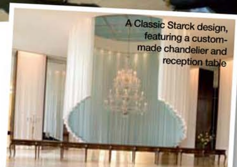
A Classic Starck design, featuring a custom-made chandelier and reception table

There is more to look forward to from Starck, especially in India. The upcoming Yoo Pune will showcase Starck's prowess in a luxe residential property being developed by Panchshil Realty. Set amidst lush landscapes and featuring a Six Senses Spa, Yoo Pune will combine Starck's sophisticated, contemporary design with a relaxed lifestyle. Above all, it will be an experience in Starck's unique approach. "We need to understand what creativity really is. It has new ideas, new language, new projects—to prepare a Renaissance and continue the work of our transformation. ■