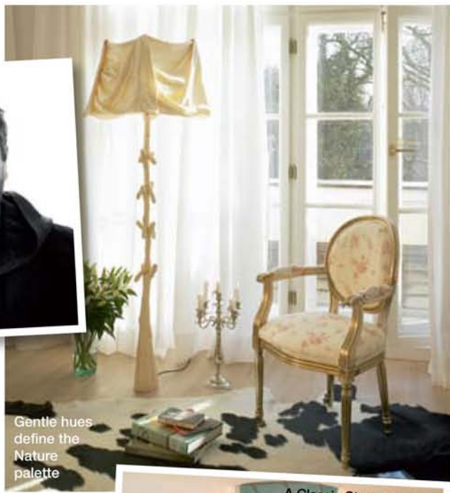
Gentle hues define the Nature palette

With a new book featuring his designs and a residential project in Pune, iconoclastic designer PHILIPPE STARCK lets Bazaar in on what's been keeping him busy