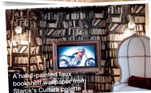
A hand-painted faux bookshelf wallpaper from Starck's Culture palette